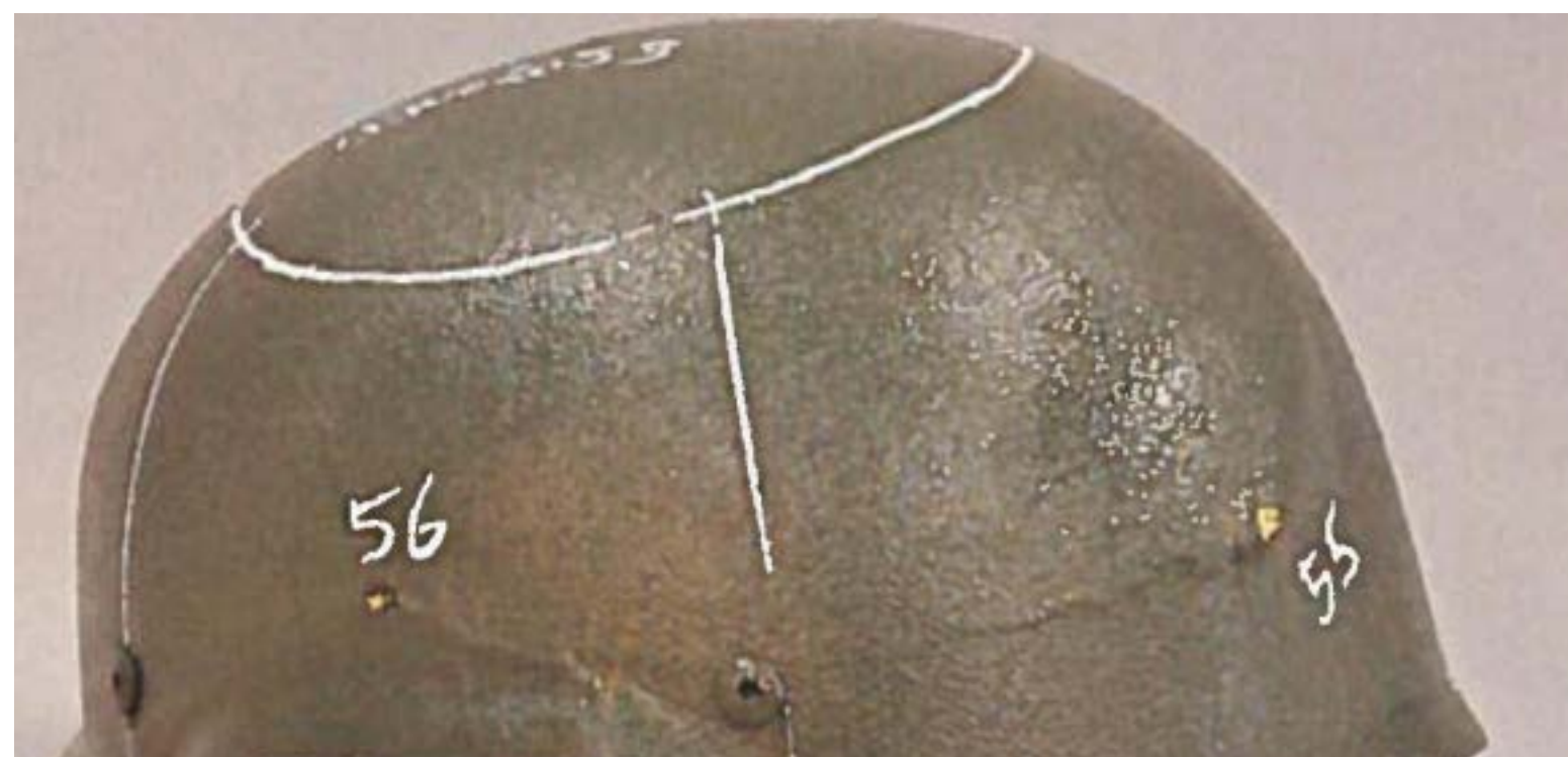
Back-Left, Sample 15SA02324 after test 15MB01987