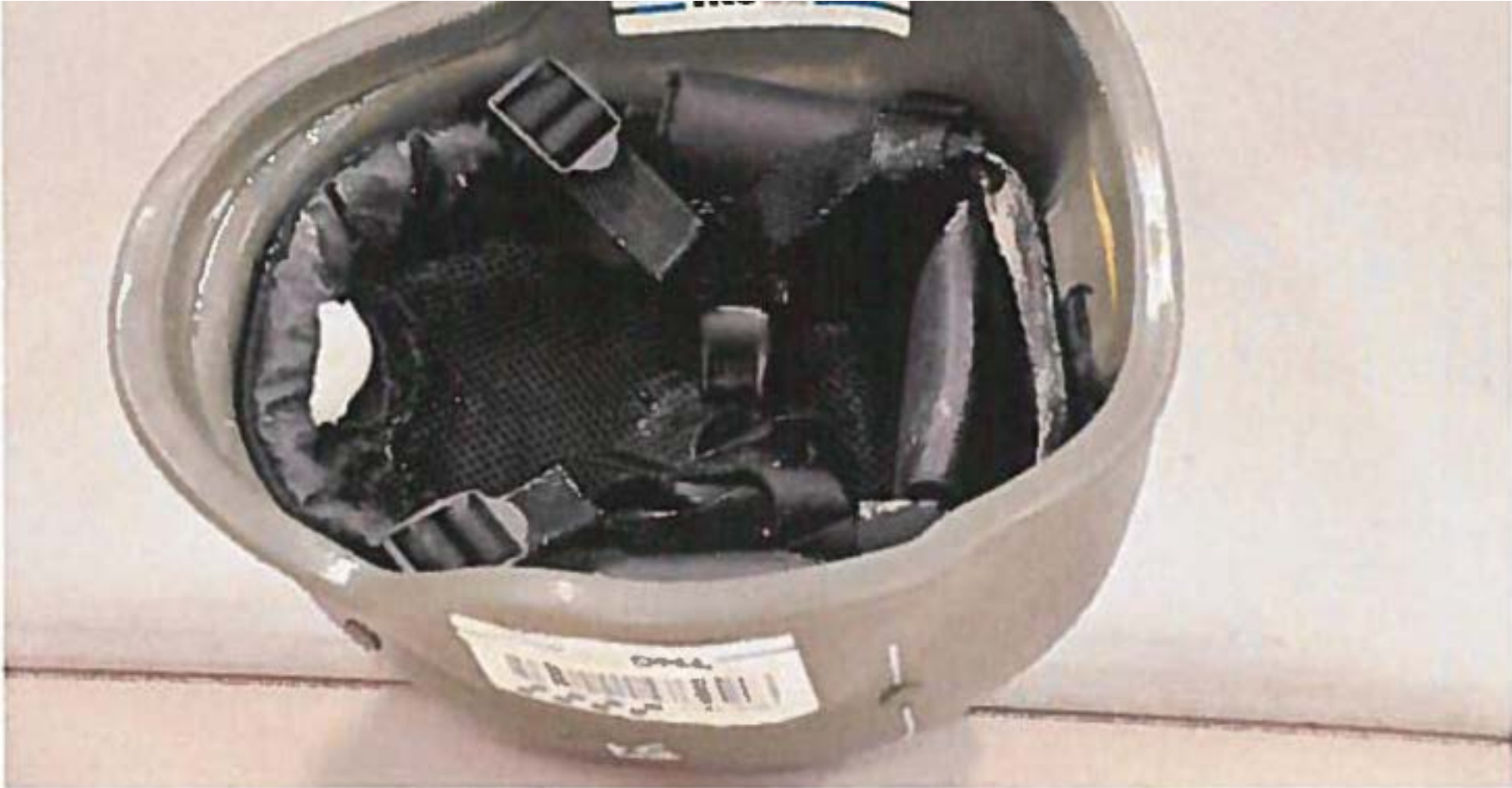
Inside, Sample 15SA02324 after test 15MB01987