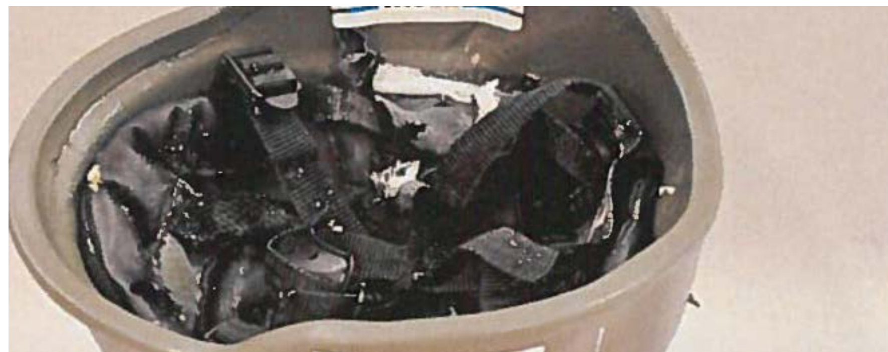
Inside, Sample 15SA02325 after test 15MB01988