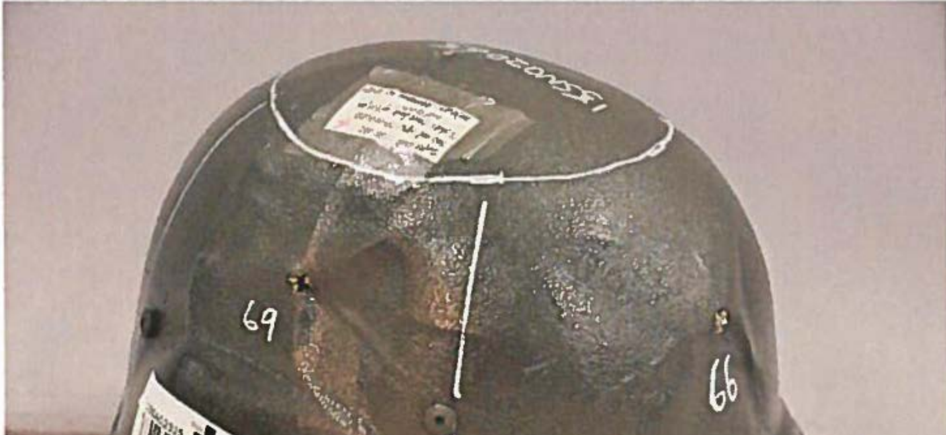
Front-Right, Sample 15SA02325 after test 15MB01988