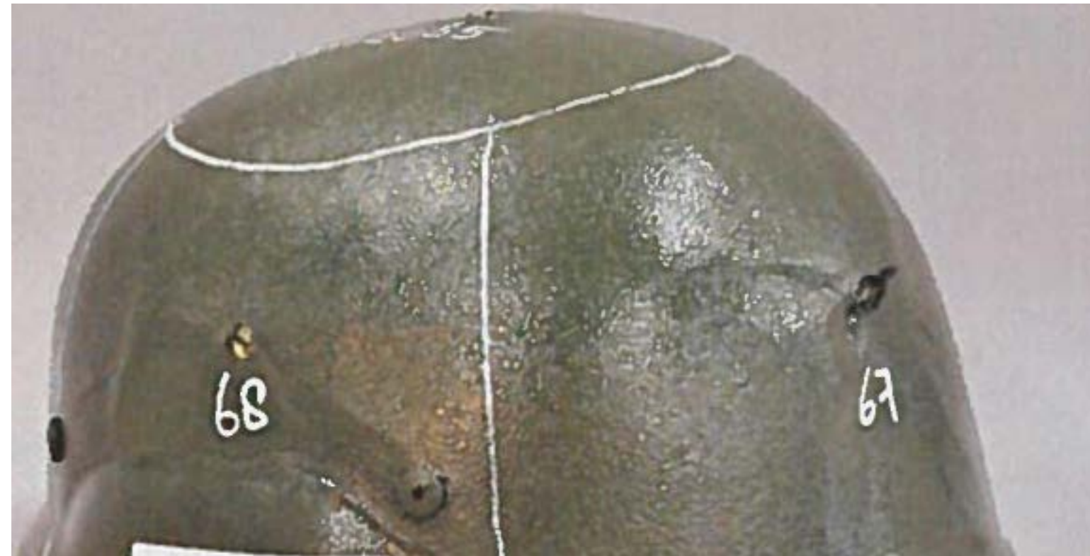
Back-Left, Sample 15SA02325 after test 15MB01988