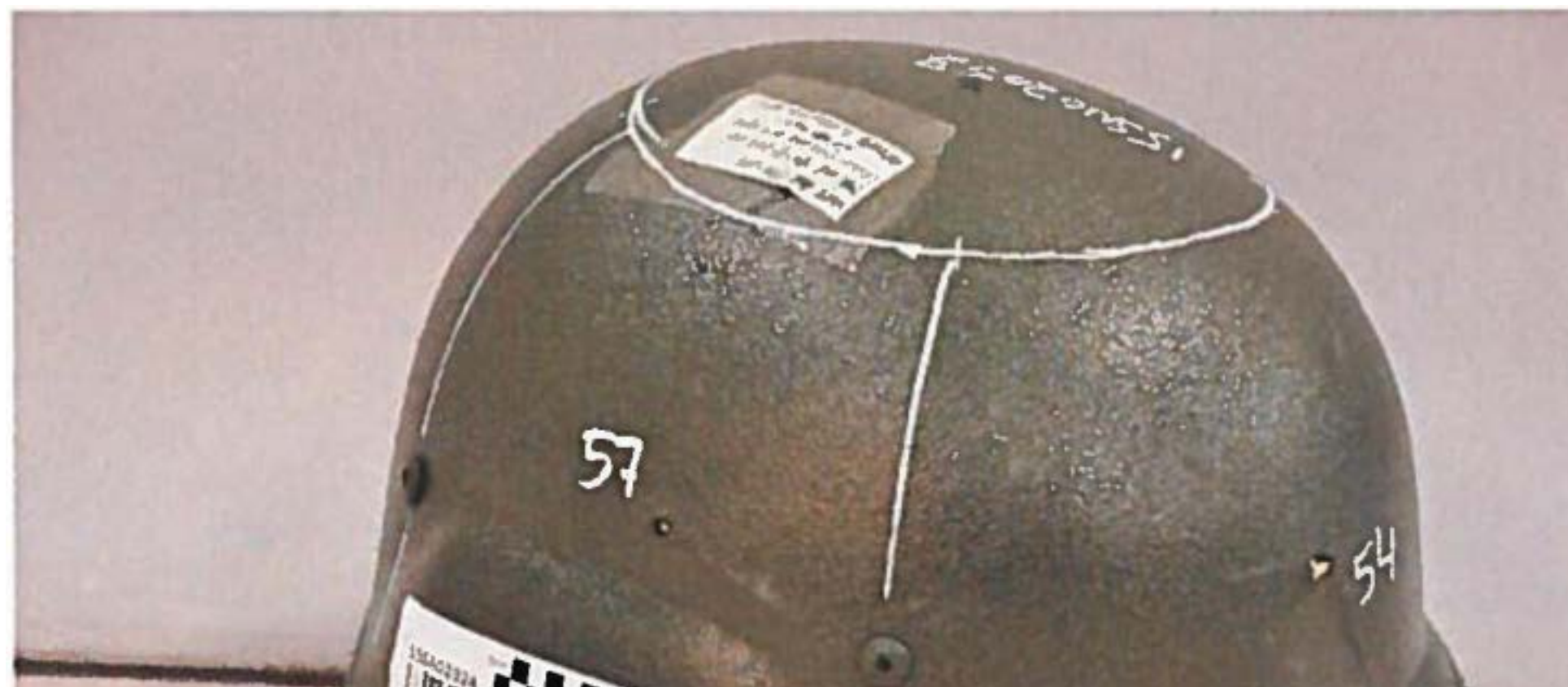
Front-Right, Sample 15SA02324 after test 15MB01987